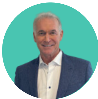
Dr Hillary Jones MBE The School and Nursery Milk Alliance