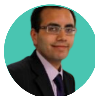
Setul Metha GLF Schools